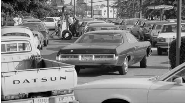
United States' support of Israel during the Arab-Israeli War led to an oil embargo. As a result, Americans experienced a gasoline shortage that led to rationing and an economic crisis relating to high prices, 1973.

Consider the history of the Middle East. One example was the creation of the State of Israel in 1948. How were diplomatic relationships carried out in the area? What role did the United States and Great Britain play? What were the long-term consequences for Israel? For diplomacy in the region? Or, students might be curious about the 1973 Arab-Israeli War and subsequent peace negotiations. What happened, and how did it impact the United States and other nations? What effect did these diplomatic relations have on the world economy?