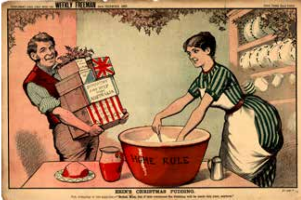
Erin's Christmas Pudding appeared in the December 24, 1887, issue of the Weekly Freeman magazine and showed international support to Ireland and the concept of Home Rule.

Think about how countries have interacted with each other. For instance, students might explore the heated debate between Ireland and Great Britain over the concept of Home Rule (1870–1919). Why was self-government important to the Irish? What debates occurred between Ireland and Great Britain due to this political movement? Did the debates lead to diplomacy on both sides? How was this debate viewed internationally? What were the short-term and long-term consequences?