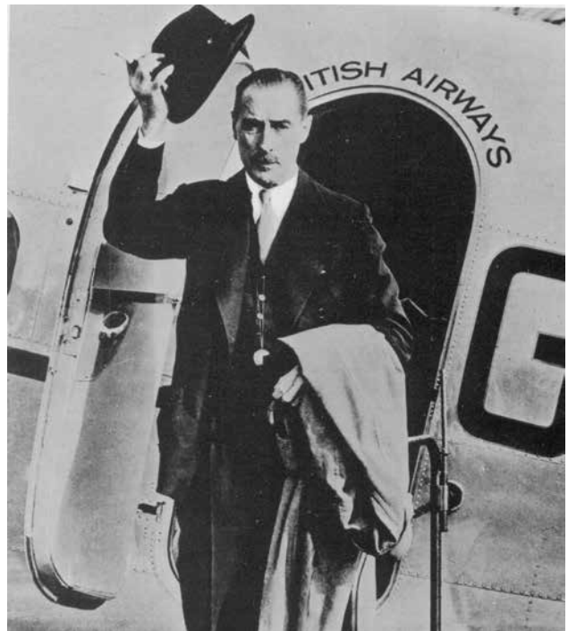
Neville Henderson, the British Ambassador to Germany, departing Croydon Airport to fly to Berlin, Germany, August 1939.

Others might look at how New Zealand established itself as a diplomatic force during World War II and its active involvement in building the United Nations (1945). Before World War II, New Zealand maintained only one foreign outpost in London, England. What changed for New Zealand? What new alliances did New Zealand establish? How did treaties involving New Zealand, such as the ANZUS (Australia, New Zealand, United States) Defence Treaty in 1951 and SEATO (Southeast Asia Treaty Organization) in 1954, influence New Zealand's status as a world power? Why did New Zealand seek to establish relationships with the United States, Canada, and Asian countries?