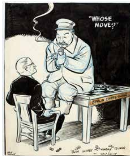
The 1948 political cartoon showed Josef Stalin seated on a table marked “Berlin Chess Game.” Stalin attempted to remove western influence in West Berlin, an area situated in communist East Germany. Truman’s and Stalin’s actions were depicted as a game of chess between two nations vying for dominance. ©Okefenokee Glee & Perloo, Inc. Used with permission.

Consider the many different topics surrounding the Cold War (1947–1991). The Cold War exposed many social and cultural issues in the Soviet Union and the United States. Students might explore the Berlin Blockade (1948-1949), the Cold War's first crisis. Soviet Premier Josef Stalin blocked U.S., French, and British railway, road, and water access into West Berlin, hoping the western powers would surrender the city. What was the initial impact of this action? How might the events have launched the U.S. and its allies into another war? How did this crisis affect the diplomatic relationship between western powers and the Soviet Union? Students might explore other Cold War topics such as the Truman Doctrine (1947), the Korean War (1950-1953), the Kitchen Debates (1959), or the Cuban Missile Crisis (1962). Who was involved? Were these events instances of successful diplomacy, or were they diplomatic failures? How did their success or failure affect the relationship between the Western and Eastern blocs during the Cold War?