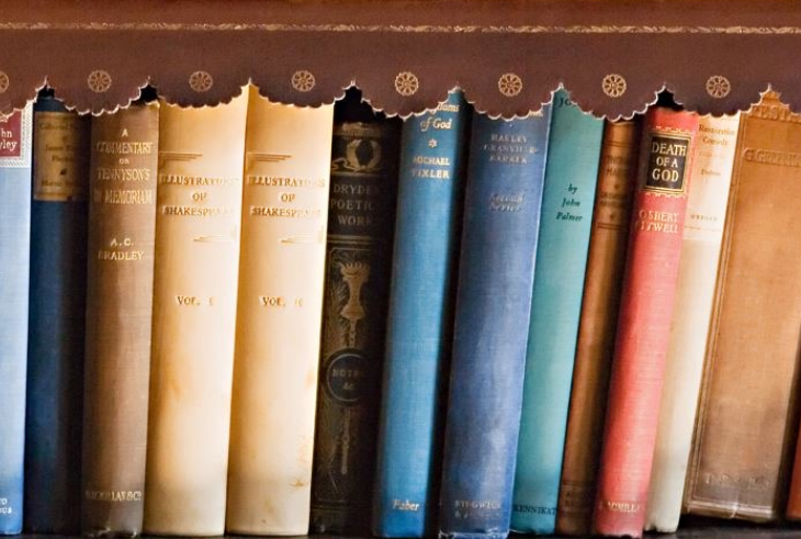
Exhibit Category Criteria

Historical exhibition presents information about an event, person, place, or idea from the past by physically displaying documents, images, or objects. We often see such exhibits at museums, but they are also presented at many other places such as archives, historic sites, park visitor centers, classrooms, and even airports and train stations. For your National History Day project, you will tell the story of your research through historic photographs, maps, drawings and other interesting objects.